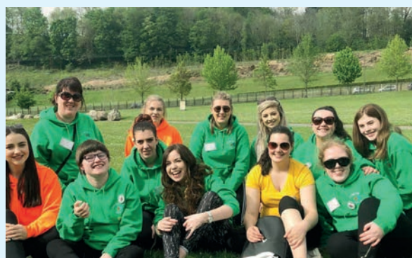
Some members of my Group 309