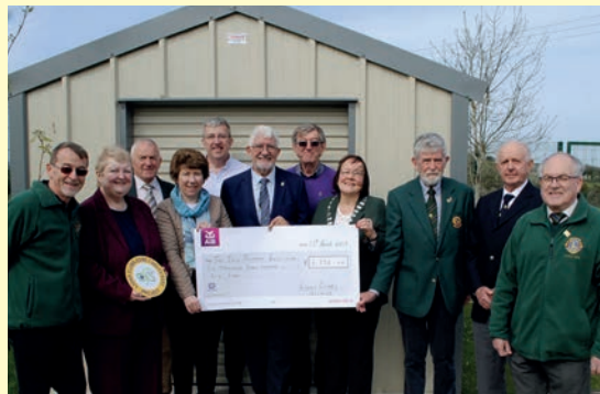
Pictured above from L to R :

These holidays support young people and adults who would not be able to avail of holidays without the assistance of others. Their needs are met by a team of volunteer carers. Trips to the beach, picnics, bowling and other entertainment are all packed into the week, creating a wonderful opportunity for the guests to experience a holiday independent of their parents and families. These holidays also provide much needed respite for the parents and families.