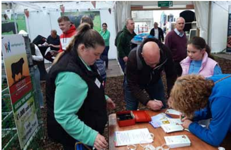
Above - Trust Volunteers busy filling entries and organising tick sales on the Angus Beef Ireland Stand

for the commitment of the wonderful volunteers who turned out each day. A generous donation was made to the Trust that will help finance the Easter 2023 trip to Lourdes.