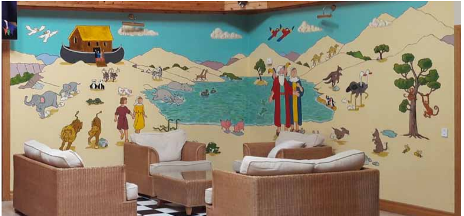
The very special Mural in Kilcuan depicting Noah and his Arky Arky