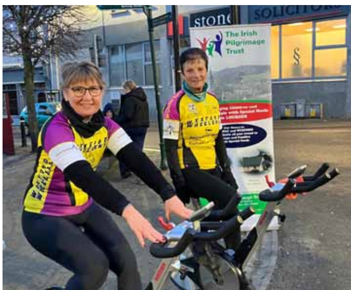
Our cycle roster for the Wexford fundraising event included members of the Wexford Wheelers and friends from our Cycle to Lourdes team.

When the Trust decided that 2023 was the time for us to resume our Easter pilgrimage activity and return to Lourdes, our special place in the south of France, everyone greeted the news with great excitement. A flurry of activity ensued as our regional organisations and groups began to shed the restrictions and get back to work. News from the regions filtered into the Trust office as more and more groups began to reassemble and start their planning for Easter 2023.