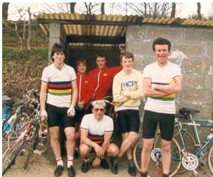
1984 - members of our first Cycle group pictured in France on their way to Lourdes

And guess what? Yes! The celebration of the ruby anniversary will be marked by a very special cycle to arrive in Lourdes on Good Friday, March 29th. 2024.