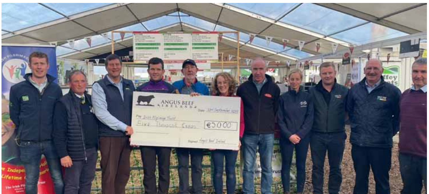
Angus Beef Ireland Staff along with fellow Exhibitors from their stand in attendance as a cheque for € 5,000 was presented to members of The Irish Pilgrimage Trust from Angus Beef Ireland at the National Ploughing Championships

Following the event, the Trust remained in close communication with Angus Beef Ireland and formally thanked them for their generosity in giving The Irish Pilgrimage Trust this exceptional opportunity and for the donation of much needed funds. Thanks was also extended to other exhibitors on the stand including Dawn Meats, Liffy Meats, Foyle Food Group, and Ashbourne Meats who made the Trust feel so welcome each day and who donated generously to the Trust.