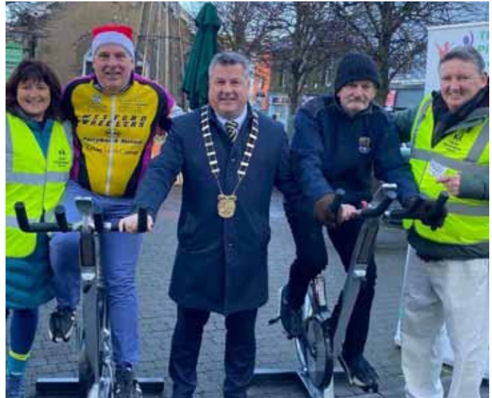
Group 308 Fundraising Bikathon got plenty of attention and support from the local business community and shoppers

the public face of the Trust and they are out there in all weather conditions, smiling and representing our organisation and showing their commitment and love for our wonderful Trust.