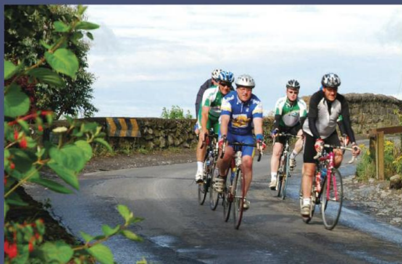
Practice Cycle - July 2009.