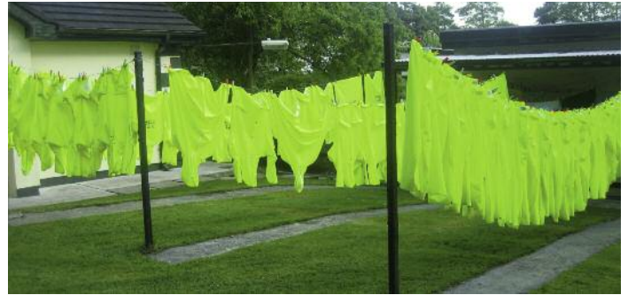
Going to Lourdes isn't all about prayer, you know! Group 136 hanging out to dry!