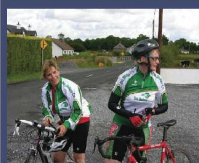
Keep a look out for our cyclists training in all parts of the country

Follow the cyclists on Facebook as they prepare and train – look up "IHCPT Cycle to Lourdes"