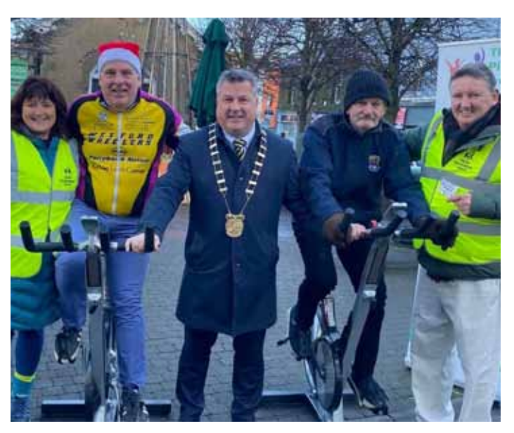
Group 308 Fundraising Bikathon got plenty of attention and support from the local business community and shoppers

the public face of the Trust and they are out there in all weather conditions, smiling and representing our organisation and showing their commitment and love for our wonderful Trust.