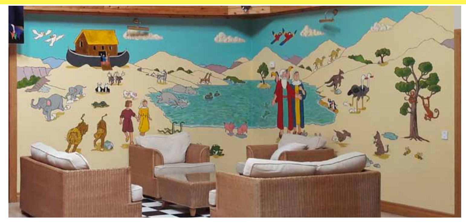
The very special Mural in Kilcuan depicting Noah and his Arky Arky