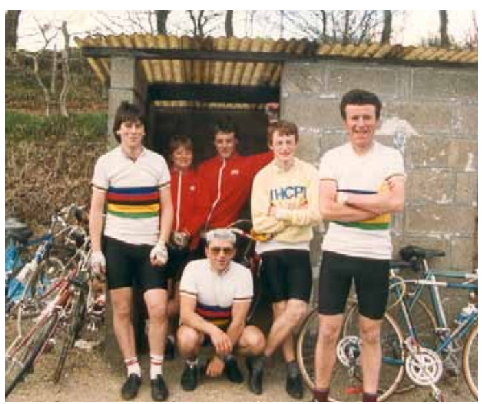
1984 - members of our first Cycle group pictured in France on their way to Lourdes

And guess what? Yes! The celebration of the ruby anniversary will be marked by a very special cycle to arrive in Lourdes on Good Friday, March 29th. 2024.