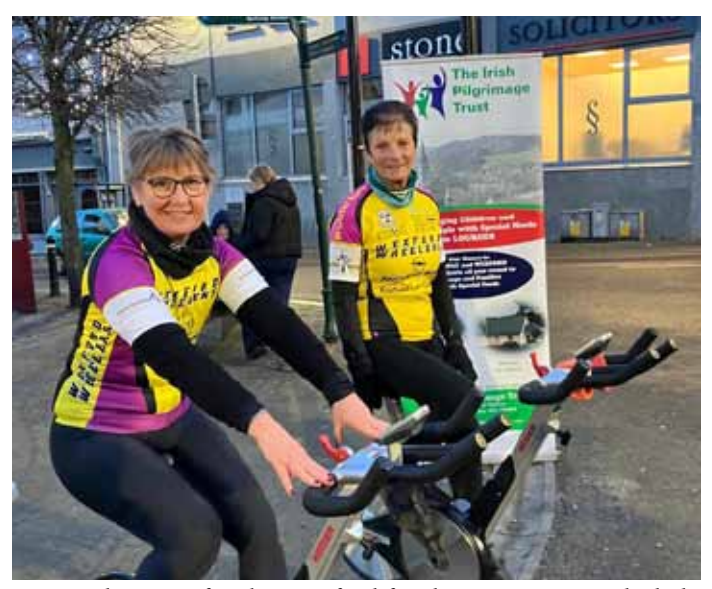
Our cycle roster for the Wexford fundraising event included members of the Wexford Wheelers and friends from our Cycle to Lourdes team.

When the Trust decided that 2023 was the time for us to resume our Easter pilgrimage activity and return to Lourdes, our special place in the south of France, everyone greeted the news with great excitement. A flurry of activity ensued as our regional organisations and groups began to shed the restrictions and get back to work. News from the regions filtered into the Trust office as more and more groups began to reassemble and start their planning for Easter 2023.