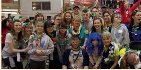
Celebration, joy and happiness in Lourdes

Each year since 1972 many very special memories have been created during The Irish Pilgrimage Trust's children's Easter pilgrimage to Lourdes. This is also true for the Trust's summertime trips to Hosanna House in Lourdes and the Friendship Weeks in Galway and Wexford at our beautiful facilities in Kilcuan and Cois Cuain.