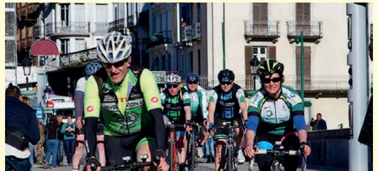
The Irish Pilgrimage Trust Cyclists arriving into Lourdes, Easter 2018

Contact our office on 091 796622 for further information and details.