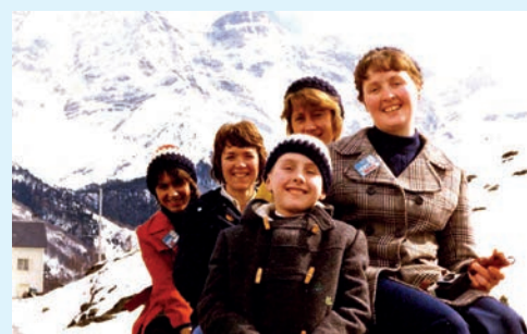
Early years of the Trust - Young guests enjoying a day trip to Gavarnie in the snow capped Pyrenees

will be able to find more details of how to tune into these masses on the Trust website closer to Easter.