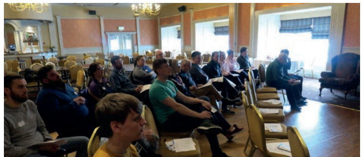
A section of the group of trainees attending the Manual Handling Training in Ballinaboola, Co. Wexford recently

There was a great turnout of members from the South East and East at the Trust's regional Manual Handling and People Moving and Handling Training course held in the Horse and Hound, Ballinaboola, Wexford on Saturday 23rd February 2019. The annual training is provided by the Trust to its members in preparation for the upcoming Children's Easter pilgrimage to Lourdes and the Summer programs in Hosanna House, Lourdes and in Kilcuan, Clarinbridge, Galway and in Cois Cuain, Kilrane, Rosslare Harbour, Co. Wexford.