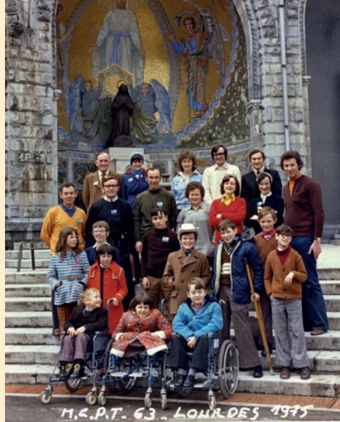
Group 63 during the Trust's Pilgrimage to Lourdes in 1975

One thing is for sure, once home both Guests and volunteers alike have a longing to return and to recapture the magic and the unique experience that is an Irish Pilgrimage Trust trip.