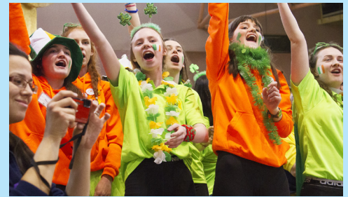
Some members of Group 751 at the Irish Mass.