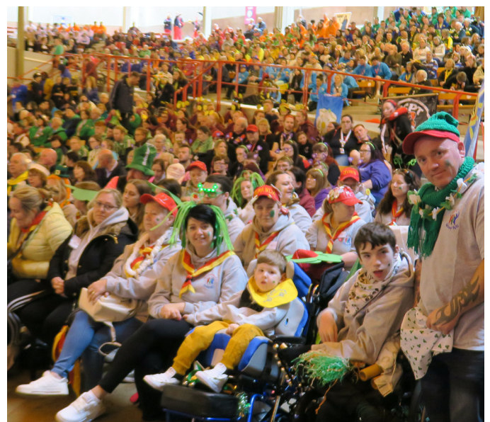
Our groups gathering for Mass during our Easter Pilgrimage week in Lourdes is just one of the memorable highlights

Our Hotels in Lourdes, the Bus companies, the cafes and all the activity centres were excellent and welcoming to all our groups. The Airport teams in Tarbes Airport were exceptional and ensured that the whole transfer operation went smoothly.