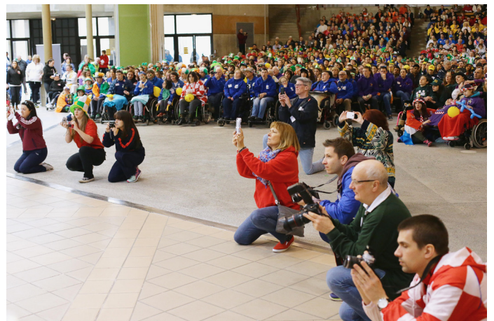
Trying to capture that magic moment, photographers get their chance to take pictures as guest present the gifts during Mass

Easter week has a certain rhythm for the Trust groups. Old friendships are rekindled. New friendships are formed. New volunteers begin their week with a little apprehension but quickly settle in. Our guests and volunteers build on the companionship and friendships formed during their pre-pilgrimage meetings. We get to know our hotels and their friendly staff and become familiar with the French language. Many within our groups reconnect with friends in other groups. Many others meet friends from our sister organisation HCPT from the UK, our friends in ASCPG from the USA, DUH from Croatia, and the ever-colourful Jamaican groups. And of course our wonderful Youth groups add that special splash of colour and boundless energy that is so important to the Trust.