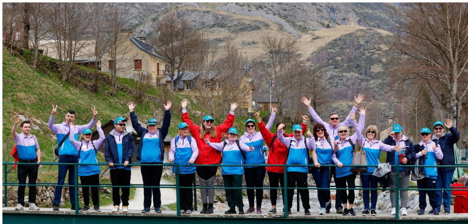
Group 308 in all their glory enjoying their trip to Gavarnie, high up in the Pyrenees

Wednesday was excursion day with poor weather forecast but the day was fine and Gavarnie in sunshine.