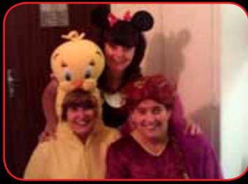
“The Good, the Bad and the Ugly!” Group 62