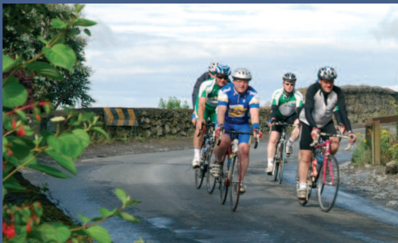
Practice Cycle - July 2009.