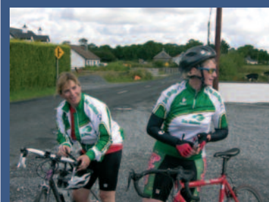
Keep a look out for our cyclists training in all parts of the country

Follow the cyclists on Facebook as they prepare and train – look up "IHCPT Cycle to Lourdes"